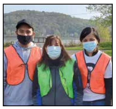
Happy to have been able to join some friendly faces for a morning of trash pick-up in Coraopolis.