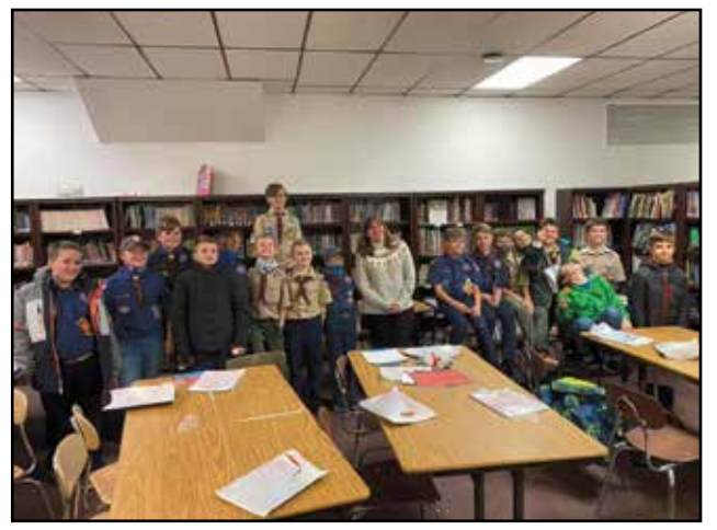
I want to thank the scouts from Pack 301 for inviting me to speak to them. What a great group of young men who had so many terrific questions!