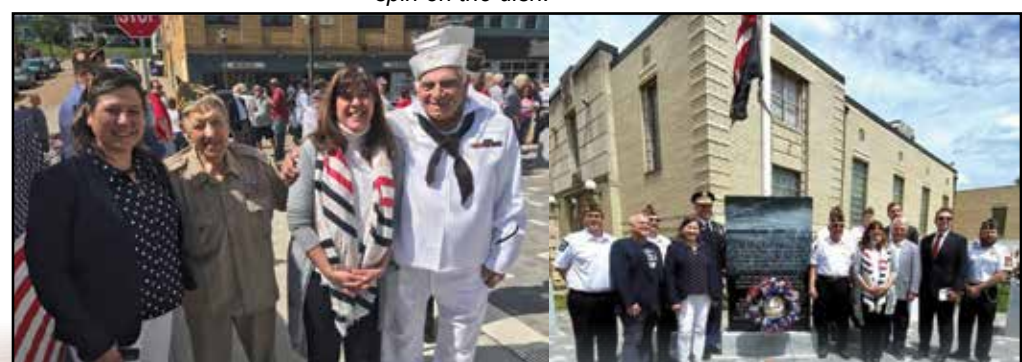
It was an honor to attend the Memorial Day ceremony in Coraopolis. I was so proud to stand with these distinguished World War II veterans.

It was great to spend a morning with volunteers who came out to plant along Main Street to make beautiful Carnegie that much more beautiful!