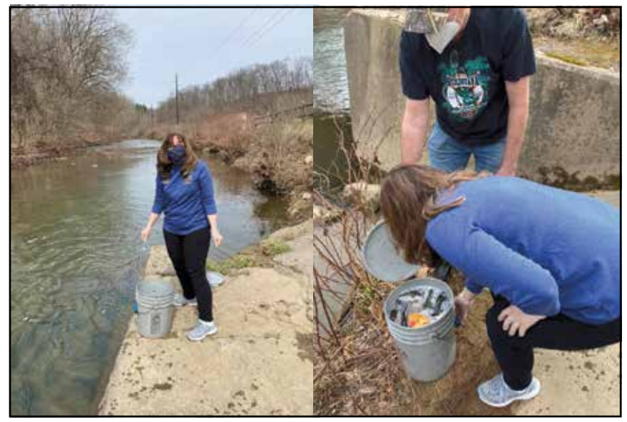
It was great to join the PA Fish and Boat Commission and other volunteers in stocking the Montour Stream Run for trout season.