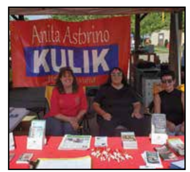
It was a beautiful day at the Robinson Township Autumn Fest!