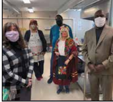
I had a fun and tasty experience judging the Focus on Renewal Haluski Contest! It was great to see the competitors put their own spin on the dish!