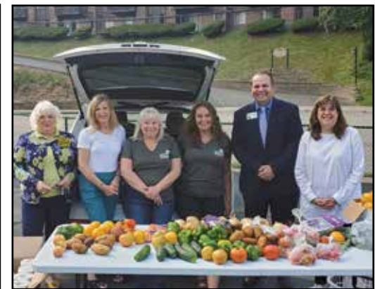
I'm grateful to North Hills Community Outreach for providing fresh produce from its garden and other staples to those in need in Emsworth and the North Boroughs.